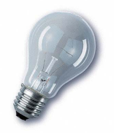
Standard incandescent lamp

This lamp type was first commercialised in 1879 by Thomas Edison and reached the limits of further efficiency improvement in its current form already towards the middle of the last century. The light is produced by a threadlike conductor surrounded by inert gas or vacuum and heated to incandescence by the electric current passing through it.