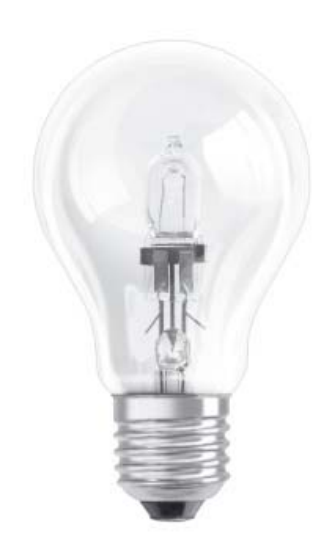
C-class pear-shaped retrofit halogen lamp

b.) the improved halogen capsule is placed in glass bulbs shaped like incandescent lamps with traditional socket, which makes it compatible with all luminaires using incandescent lamps (sold as retrofit "energy saver lamps").