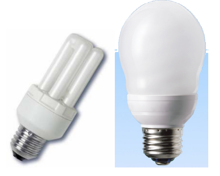
Compact fluorescent lamps with bare tubes and with bulb-shaped outer lamp envelope

It consists of fluorescent lamp tubes, for which the ballast is not sold as a separate item as for large tubes, but integrated into the lamp, which becomes a standalone retrofit solution to incandescent lamps. It was first commercialised in the 1980's. Its main interest lies in its long lifetime and high efficiency, the lamp will use between 65% and 80% less energy (from a third up to the fifth of the energy) for the same light output compared to incandescents. It sometimes comes with an external envelope which hides the tubes and makes it even more similar to light bulbs (though decreasing its efficiency). The envelope also shields off any unwanted ultaviolet radiations and risks connected to incorrect disposal.