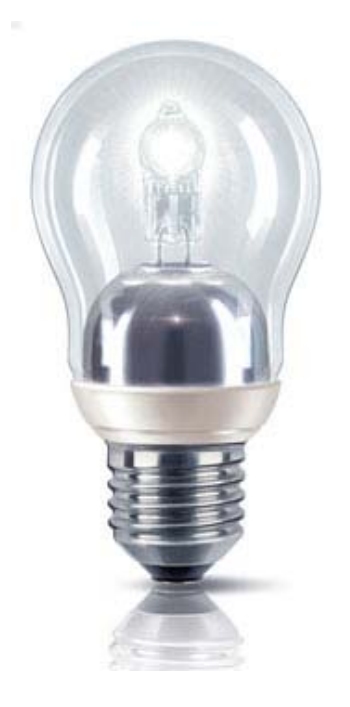
B-class pear-shaped retrofit halogen lamp with integrated transformer

Recent technology. Applying an infrared coating to the wall of halogen lamp capsules considerably improves their energy efficiency, the lamp will use about 45% less energy for the same light output compared to the best incandescents. However, for technical reasons, this is only possible with low voltage lamps, so a transformer is needed, either as a separate unit, or integrated into the luminaire, or integrated into the lamp for an incandescent retrofit solution. As with the Halogen C lamps, both the special socket capsules and incandescent retrofit lamps are available in B class, however currently only one manufacturer is producing retrofit lamps (even though the technology is not protected by patents). Because of the heat coming from the lamp which affects the operation of the integrated transformer, their retrofit lamps are available only up to the equivalent of a 60W incandescent bulb.